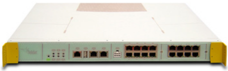
Teldat Atlas-60/ Atlas-i60

A further internal challenge for Produban was that Santander Bank in Mexico had no standard telecommunication product harmonization. Many routers of different brands have been used for the same function across the over thousand Santander bank branches in Mexico. The technical department had to have a vast knowledge of many devices and their corresponding software. A large amount of engineers had to handle the maintenance and necessary developments in order to keep the telecommunication setup up to date. The big engineering team for supporting the network of different branded devices caused higher costs. Also having a high quantity of brands reduced the efficiency of the maintenance team.